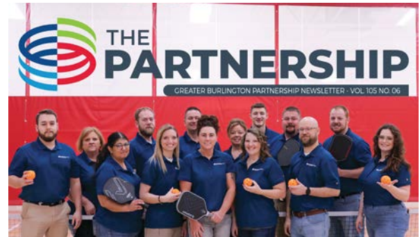
The Partnership Newsletter