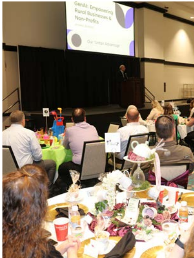
Small Business Breakfast