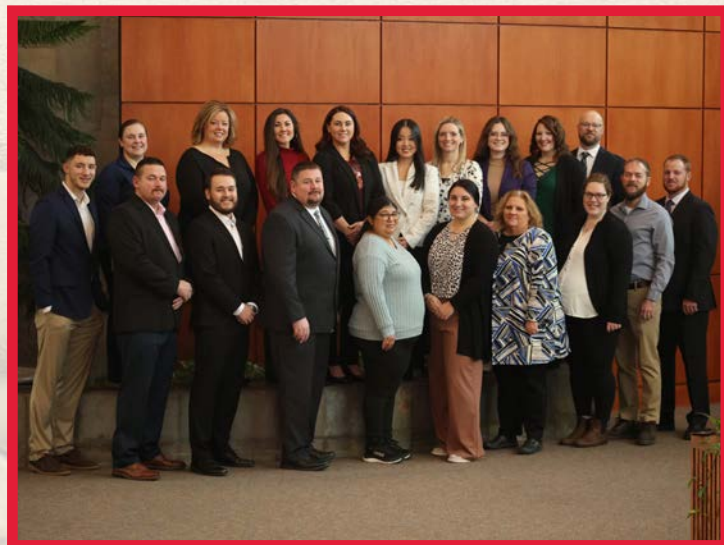
Greater Burlington Leadership