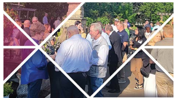
Marketing & Sponsorship Opportunities