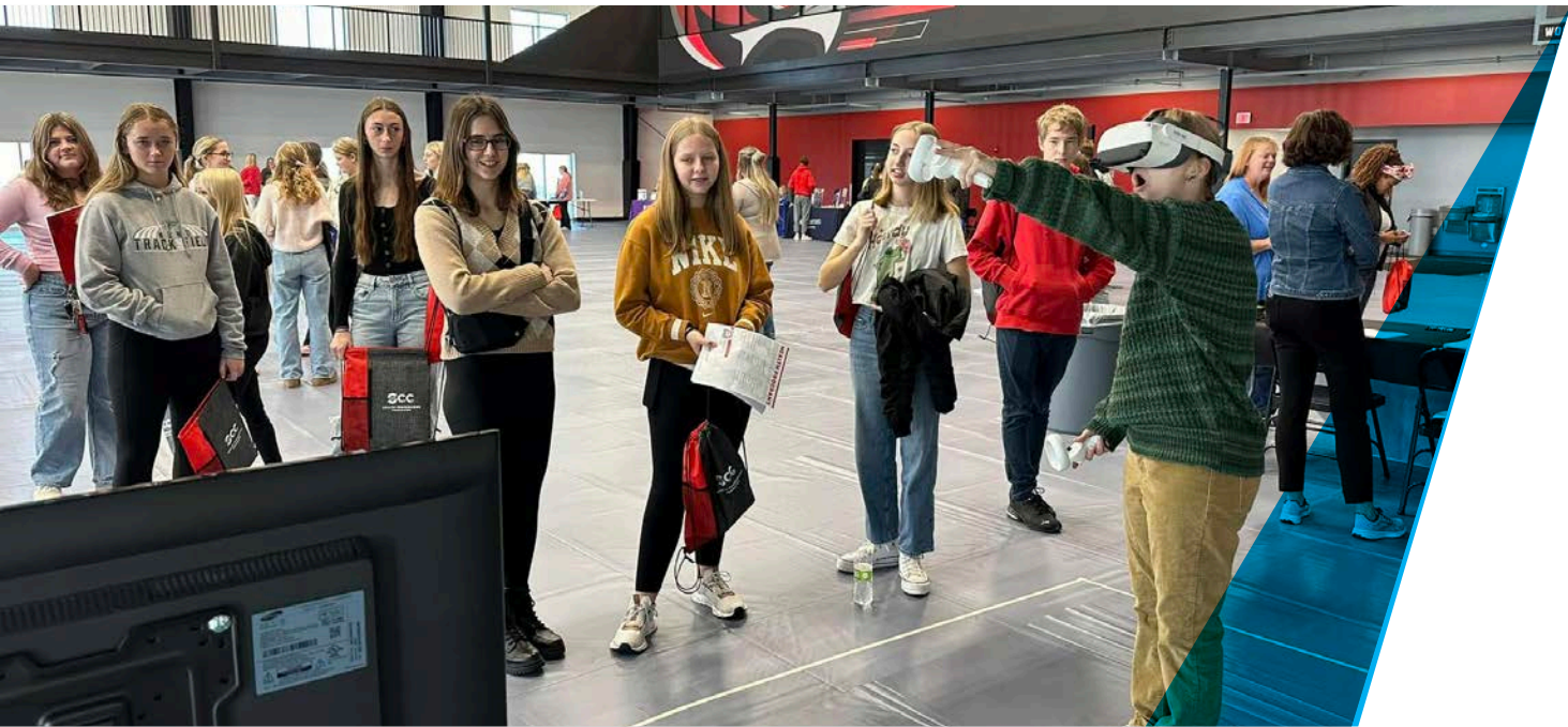
Transfer VR Headset at SCC Career Exploration Day

While many of the Chamber's benefits are front and center, there's a whole world of behind-the-scenes work we do every day to help your business, and the Greater Burlington area, thrive. These efforts are included in your membership and are designed to move the needle on long-term growth, visibility, and community prosperity.