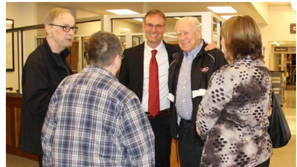
Business After Hours & Holiday Showcase