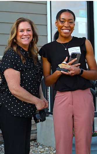
Business After Hours

Everybody loves a good party and celebration! From social gatherings to Greater Burlington's Annual Dinner, the Chamber of Commerce hosts events around a number of different topics throughout the year. Being a member, a number of these are free to attend with others being exclusively for members and their guests. Find out more about each event below and start marking your calendars for events to attend.