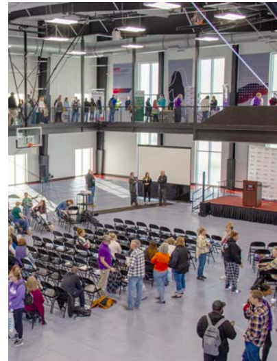
Area Educator Expo

The Golf Classic is a chance for people to market their business and brand visibility, such as sponsoring a hole with games to have fun with the players.