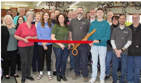
Ribbon Cuttings & Groundbreakings