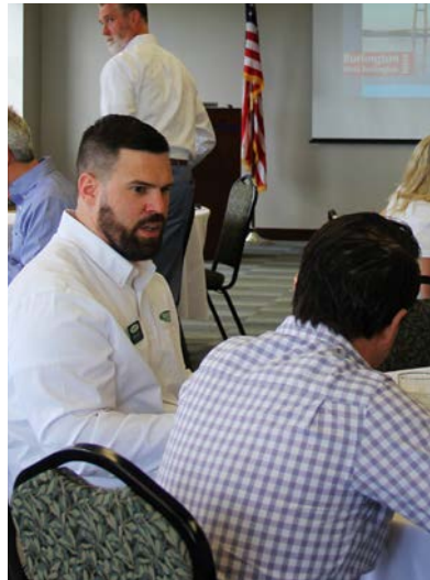
New Member Luncheon